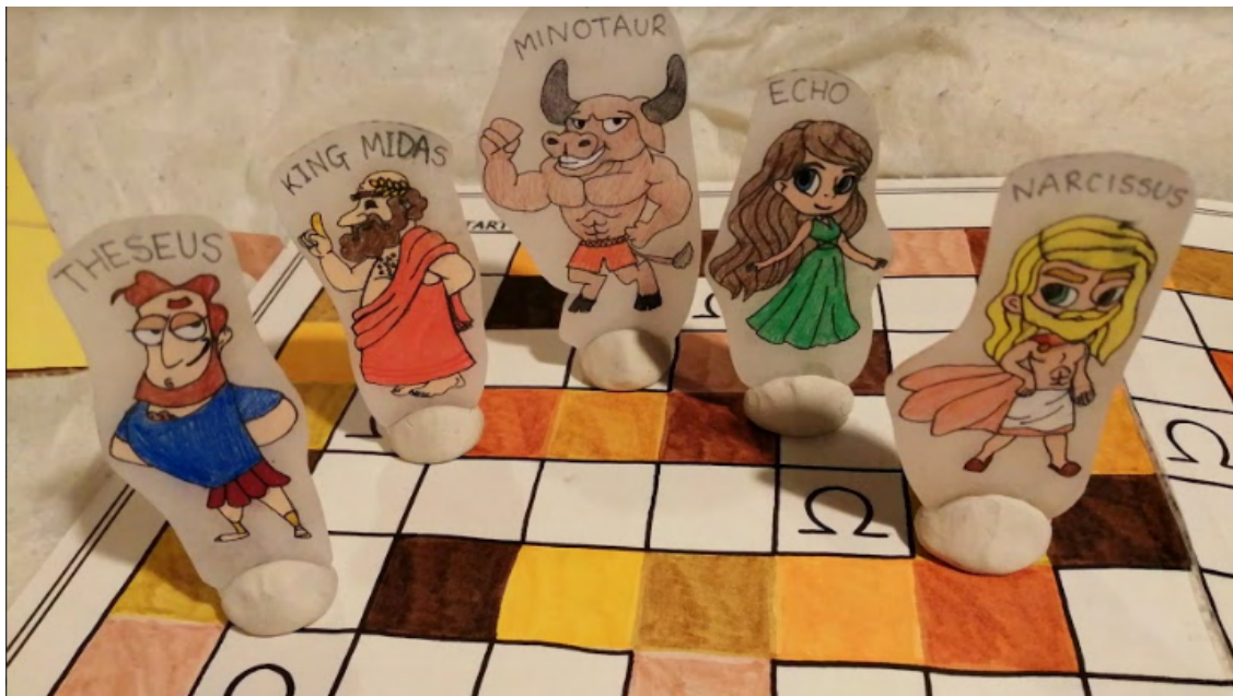
This inspired 'Ovido' board game was last year's joint winner from a Y8 student.

Good luck to all - we can't wait to see your entries!